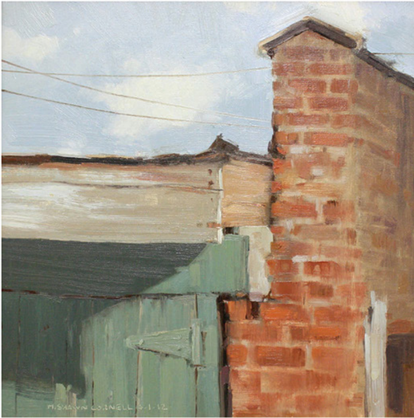
Sunday, April 1, 2012 (10:15-1:00) Location: Demenil Place, St. Louis, MO 2012, oil, 12 x 12 in. Private collection Plein air