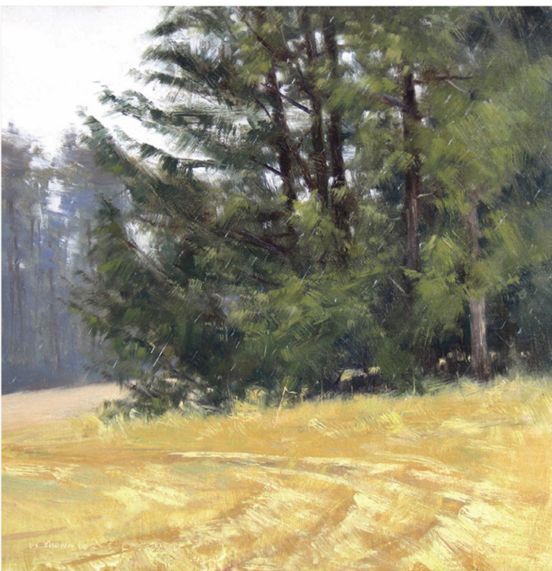
Thursday, January 21, 2010 (10:15-12:00) Location: Shaw Nature Reserve, Gray Summit, MO 2010, oil, 12 x 12 in. Private collection Plein air