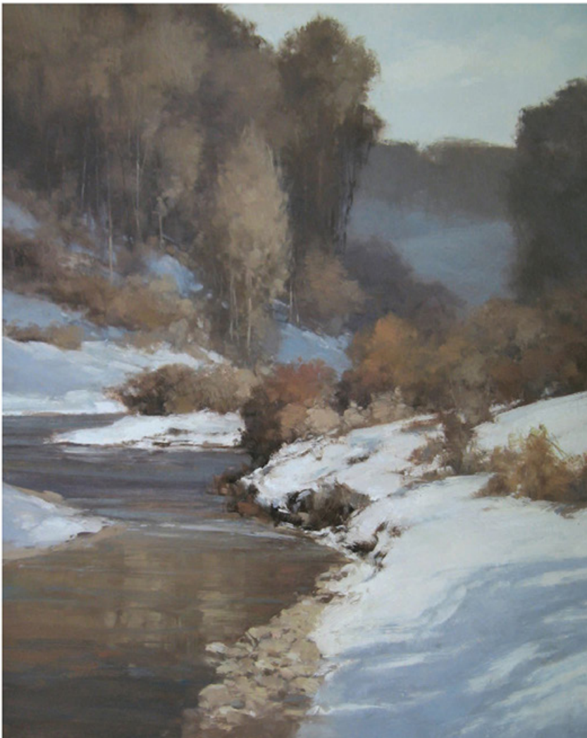
(Below) Tuesday, February 8, 2011 (10:00-3:00) Location: Castlewood Park, Ballwin, MO 2011, oil, 24 x 18 in. Private collection, Plein air