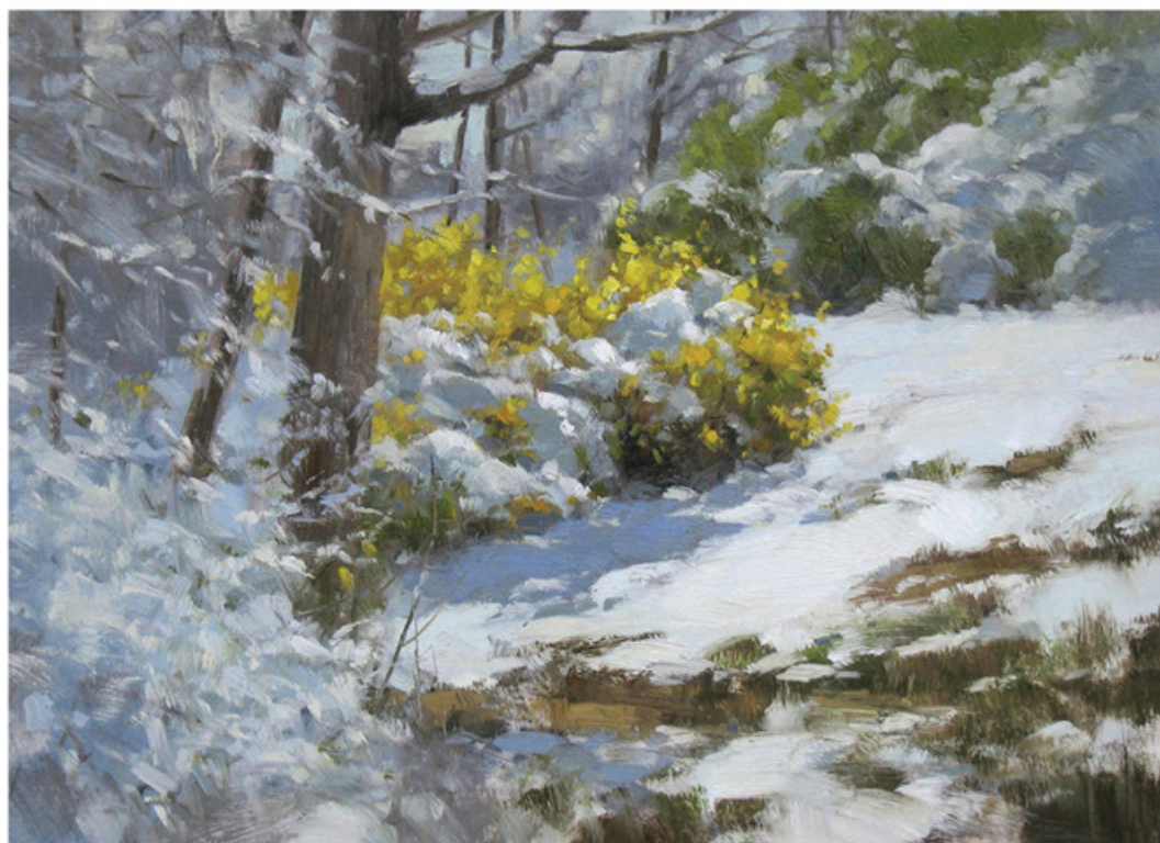
Sunday, March 27, 2011 (11:00-2:15) Location: Bee Tree Park, St. Louis, MO 2011, oil, 12 x 16 in. Private collection Plein air