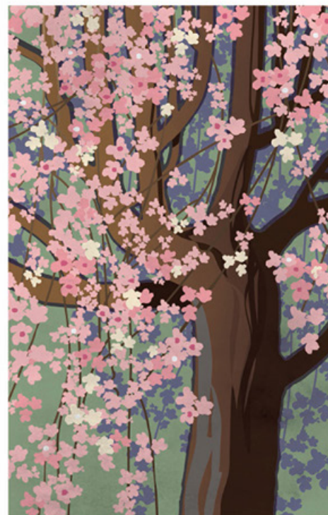
Morning Weeping Cherry 2013, print, 36 x 24 in. Collection the artist

Sunday, April 1, 2012 (10:15-1:00) Location: Demenil Place, St. Louis, MO 2012, oil, 12 x 12 in. Private collection Plein air