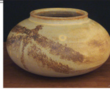
Ten Dragonfly 2013, pottery, 3 1/2 x 6 in. Collection the artist